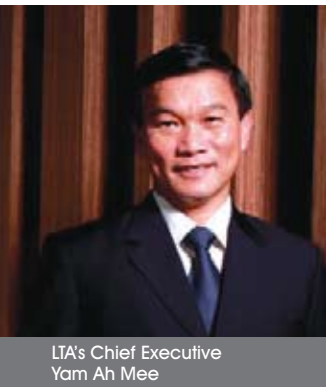
LTA's Chief Executive Yam Ah Mee

Four new MRT lines, three new extensions to the existing MRT network, more comprehensive and convenient bus routes, two new expressways – these are some of the more visible enhancements commuters in Singapore can look forward to as the Land Transport Authority (LTA) continues to implement its vision for moving people in the foreseeable future.